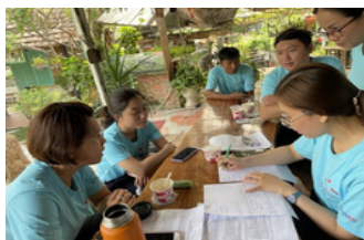
Picture 2: Training for Human Health and Animal Health Staff Working in Applying One Health Core Competencies and Providing Mentoring to Students at One Health Sites